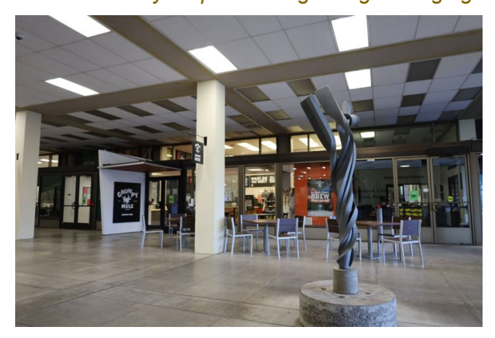
Image 5. Picture in front of the bright, well-advertised storefront of a commercial coffee shop on campus which overpowers the Multicultural Center to the right which appears dark and without a sign.

Our survey findings similarly reveal a tension between belonging on campus and the need for greater representation. On average, student respondents feel a strong connection to the community on this campus (M =3.34, SD = 1.74) and that their culture is valued on campus (M = 2.67, SD = 1.43). Additionally, over half of student respondents report they agree with the statement, "on campus there are enough opportunities to gain knowledge about my own cultural community" (M =3.01, SD = 1.58). By the same token, 1 in 5 student respondents said they have considered leaving Sacramento State because they felt isolated or unwelcome (M = 5.23, SD = 2.04). Of particular concern, 14.3% of survey respondents reported feeling discriminated against in the last 12 months at Sacramento State.