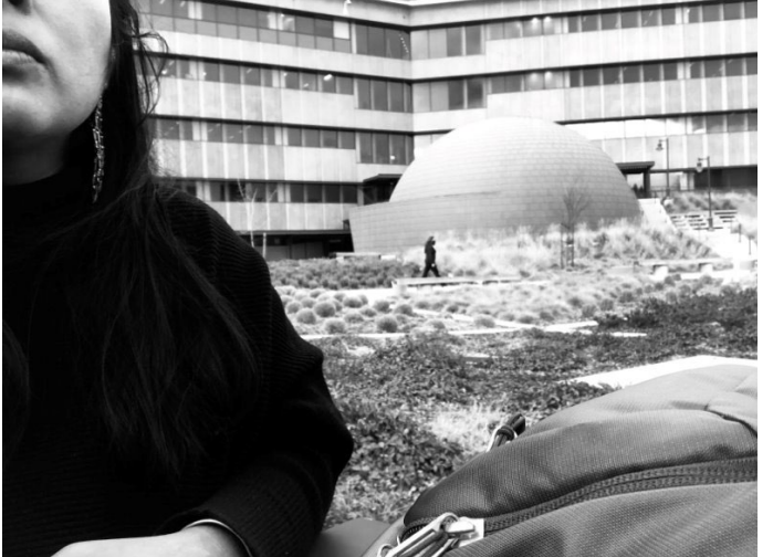
Image 4. Part of the face and body of an Indigenous Latine student seated in front of the new Science building on campus. Their face was obstructed to illustrate how they felt unwelcome in this new building.

One theme identified by student co-researchers entitled, " Great Intentions, Needs Attention " highlights how Latine students urge the campus to do more.