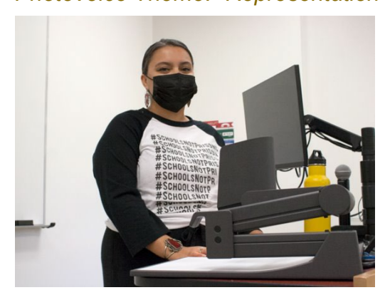
Image 2. Picture of Latine faculty member taken to exemplify Latine representation among faculty and a place in which they felt Latine culture was reflected.

Student co-researchers spoke directly to representation with their theme, "Representation of the Latine culture is needed in our classroom." They summarized their theme as follows: "We need more representation of our Latine culture in our classrooms and curriculum. We need more professors who reflect the diversity of our student body and who can bring unique perspectives and cultural knowledge. We need to have more of our culture represented in our curriculum in terms of readings, discussions, and activities. Although many of us have found this happening in Ethnic Studies, we need this in all areas.