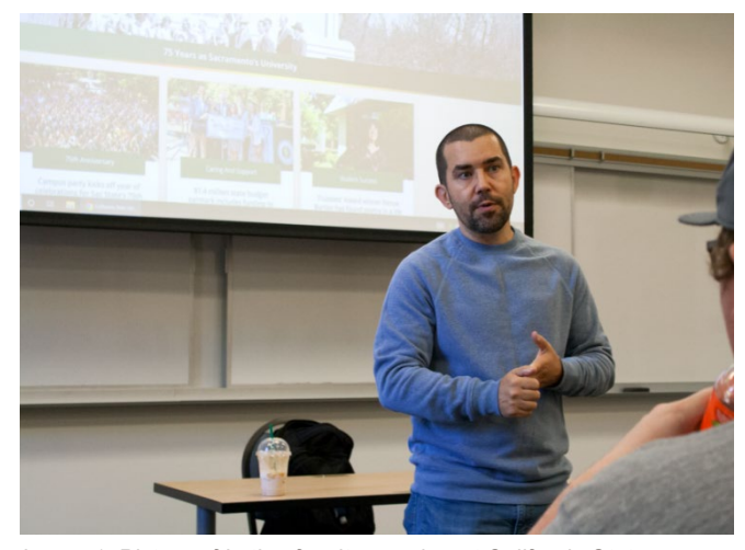
Image 1. Picture of Latine faculty member at California State University, Sacramento.

• One in 5 survey respondents said they have considered leaving Sacramento State because they felt isolated or unwelcome.